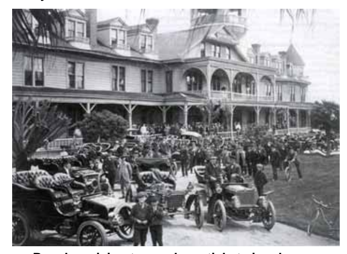
People arriving to purchase tickets in advance

I am proud to announce my appearance in a local community theatre production of "Chicken Every Sunday," to be performed in Escondido on each Friday and Saturday evening and Sunday afternoon between January 27<sup>th</sup> and February 19<sup>th</sup>. The play is a comedy and suitable for people of all ages--truly a family show!